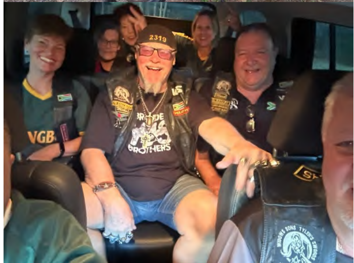
Widows Sons KZN Chapter, celebrating brotherhood companionship and Freemasonry