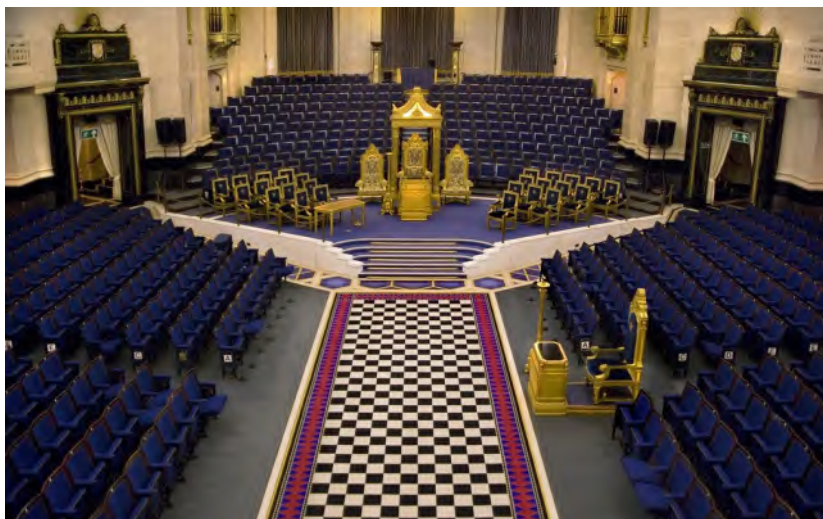
The Grand Temple at Freemason's Hall, London

If you want to see Directors of Ceremony who are at the top of their game Grand Lodge / Freemasons' Hall is the place to be. The MW Pro Grand Master had two hundred hands to shake and it was run with military preci-