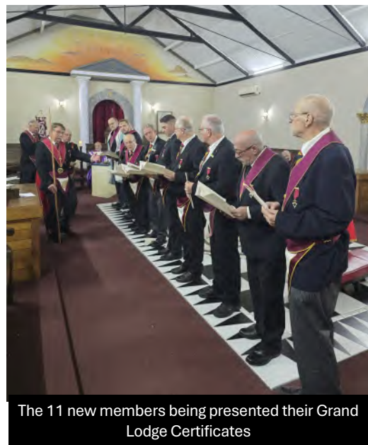
The 11 new members being presented their Grand Lodge Certificates