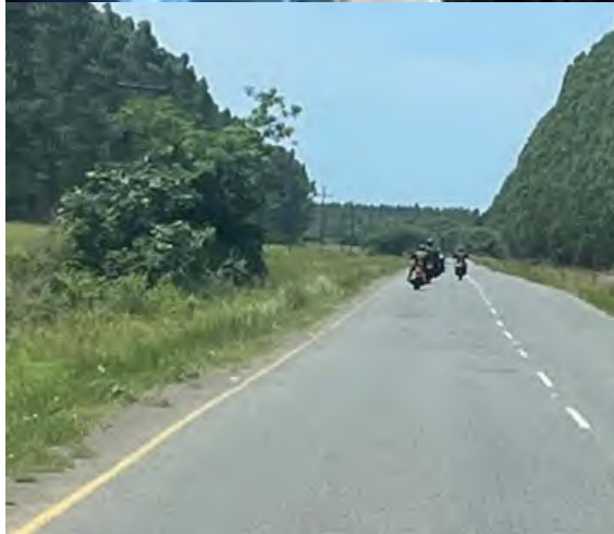
Brothers riding in formation toward St Lucia, with KZN's lush greenery in the background

roaring up the north coast. Our convoy of bikes wound its way toward the first stop at Engen 1-stop just before Richards Bay, for a hearty breakfast, and a cheeky ice cold Amarula liqueur which was passed around. Then off to the UNESCO World Heritage Site, with the coastal town of St Lucia as our destination. The route offered a mix of open highways and winding access roads, perfect for soaking in the freedom of the ride while enjoying the camaraderie of our fellow brothers. The