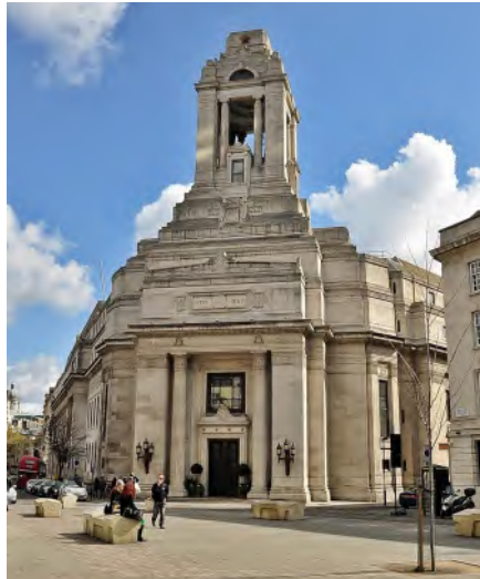
Freemason's Hall, 60 Great Queen Street, London

If it is at all possible, and within financial reach, every Brother should do his best to go to Grand Lodge at least once in his lifetime. The sheer magnificence and aura of the place fills one with awe and inspiration to become the best Mason that one can be. For me to have received Grand Lodge rank has been a privilege indeed, and I am