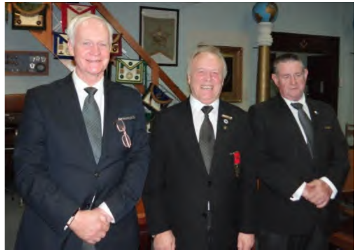
Above: The Master and his Wardens, ready for the another memorable D.I.M.S. Lodge evening

The Lodge has an ongoing project with Highway