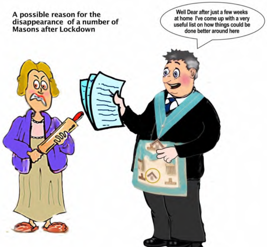
A possible reason for the disappearance of a number of Masons after Lockdown