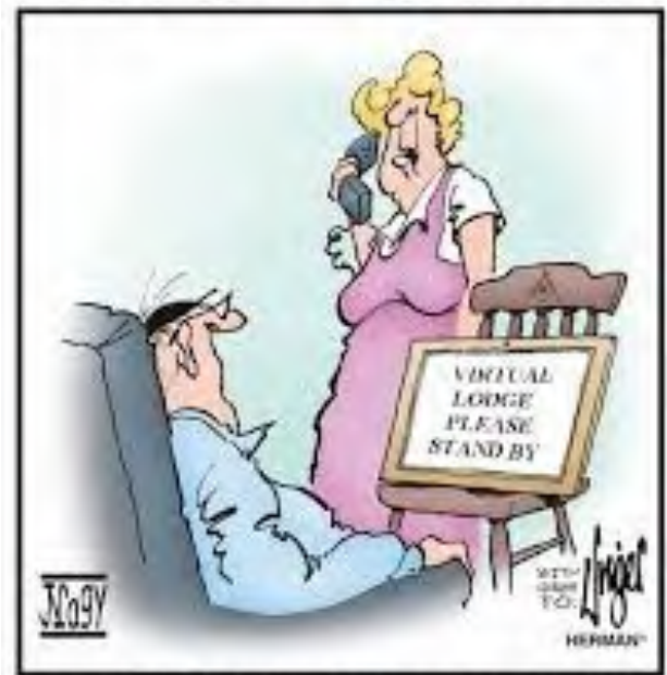
Hey! Worshipfull Your Secretary says, "enable your web-camera to join in on your web-lodge."